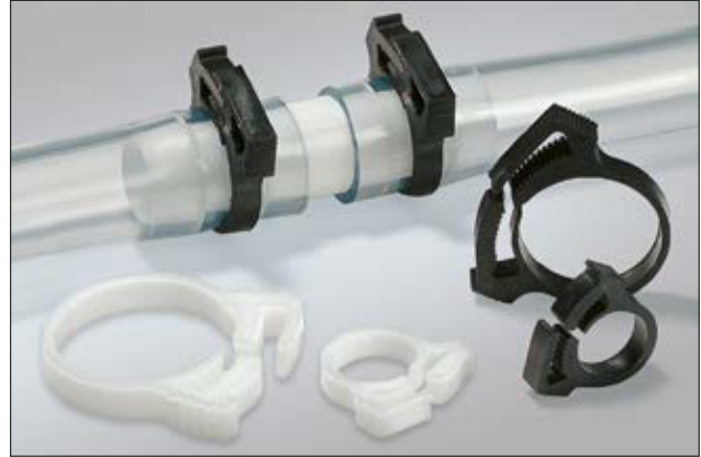
SNP - Snapper Hose Clips range.