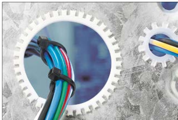
Optimal protection of cables and wires at panel edges.