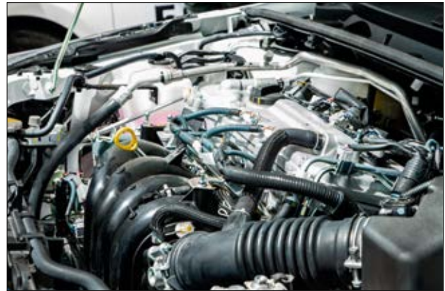
SA47-HT provides optimum protection against moisture in high temperature applications.