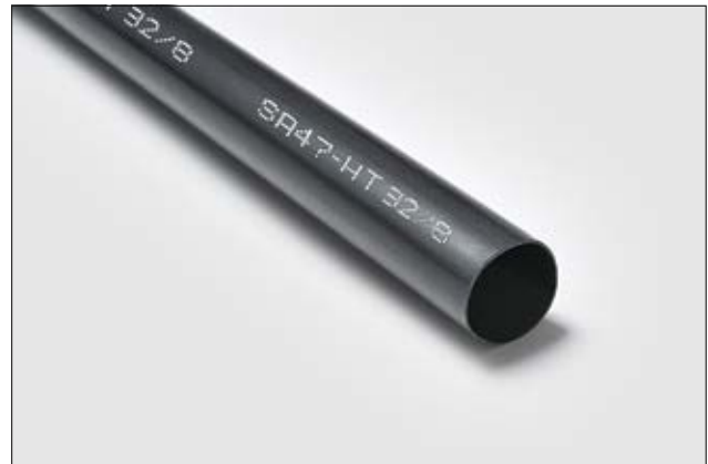
Heat shrink tubing SA47-HT for 150 °C application.