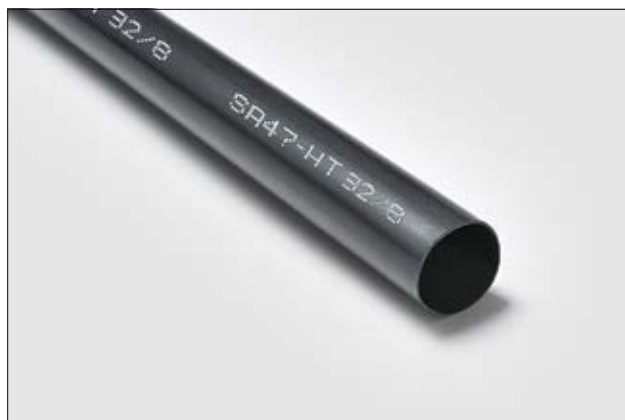
Heat shrink tubing SA47-HT for 150 °C application.