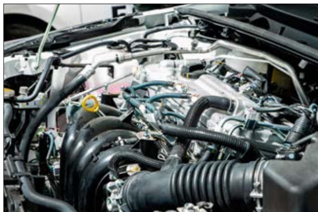
SA47-HT provides optimum protection against moisture in high temperature applications.