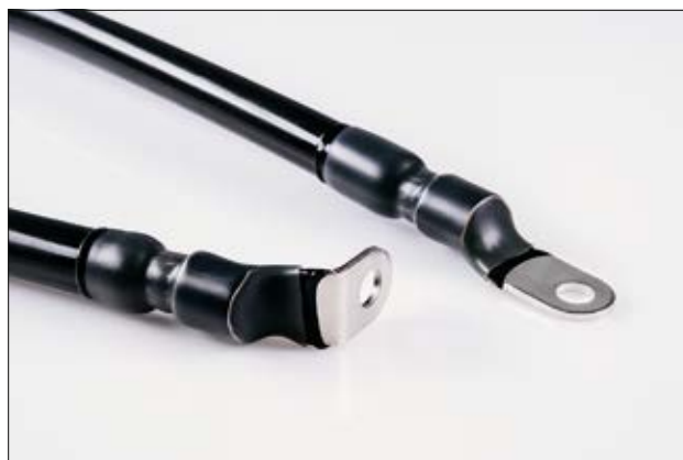
Heat shrink tubing SA47-LA for cable connection.