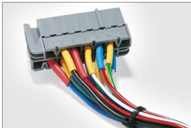
HFT-A conforms to major standards (VG) used in all Defence industries.