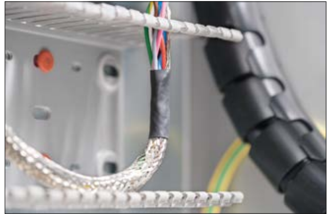
TF21 – available in a wide range of colours and sizes.