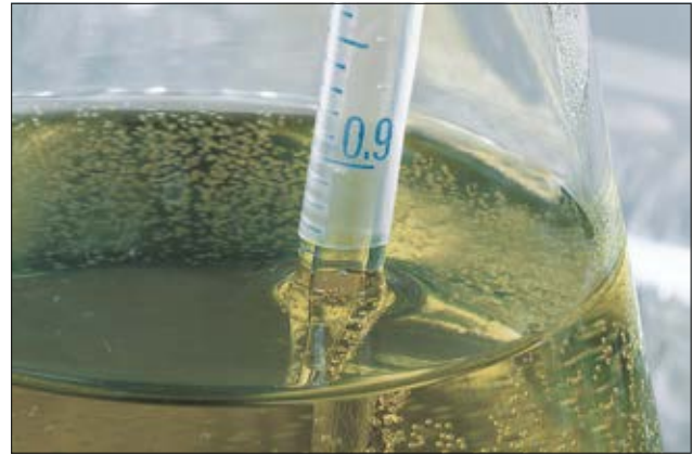
TK20 is often used for chemical applications.