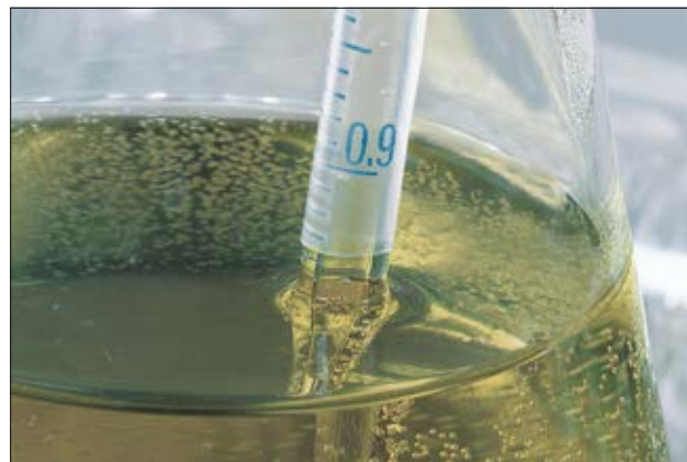
TK20 is often used for chemical applications.