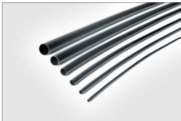
TA37 - adhesive lined tubing for safety sensitive areas.