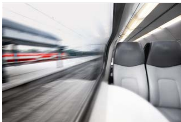
Mainly used in railway applications.