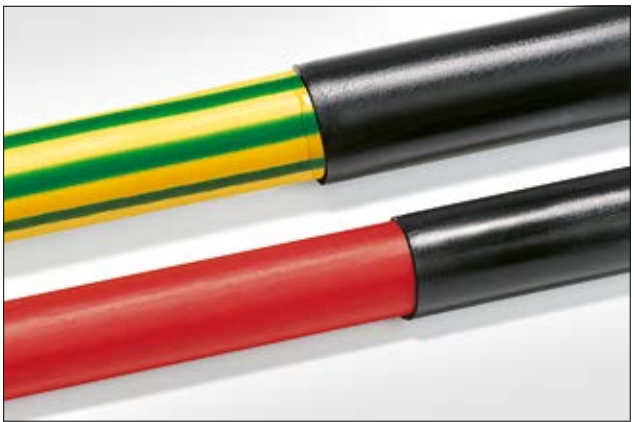
TA32 and TA42 are UL224 listed adhesive lined tubing. Available in 3:1 and 4:1