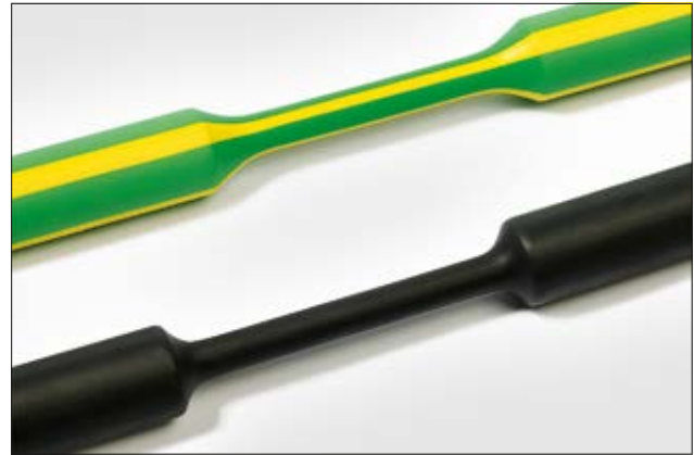
TREDUX shrinks a maximum of 3:1.

More colours on request. Please contact us!