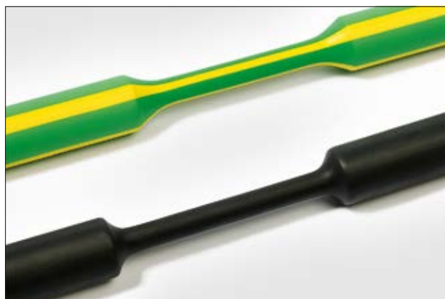
TREDUX shrinks a maximum of 3:1.

More colours on request. Please contact us!