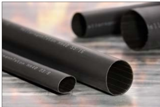
HA40 thick wall, adhesive lined and flame retarded tubing for shipbuilding applications.