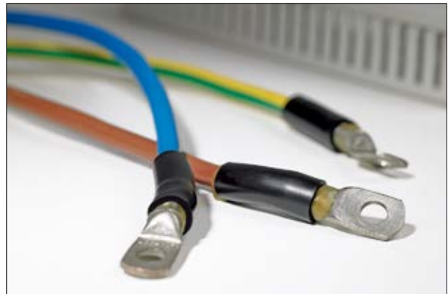
Heavy wall tubing.