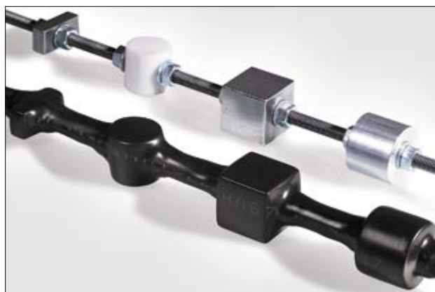
Due to the high shrink ratio HA67 is suitable for complex shapes and dimensions.