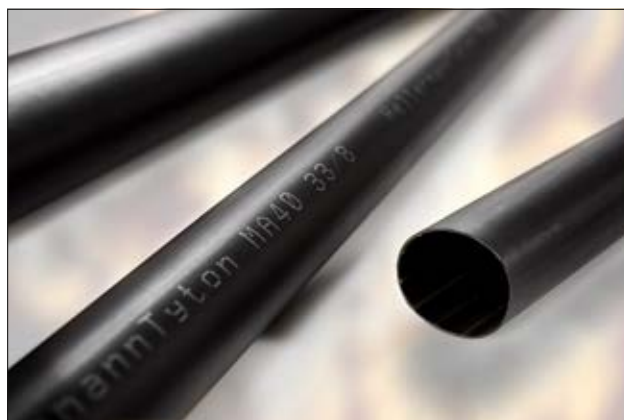
MA40 medium wall, adhesive lined and flame retarded tubing for shipbuilding applications.