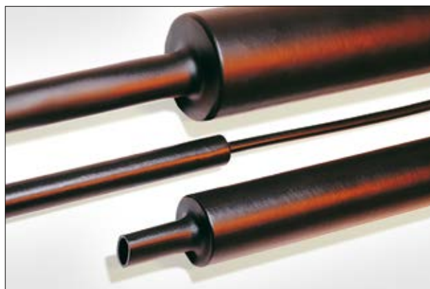
MU47 is resistant against solvents.