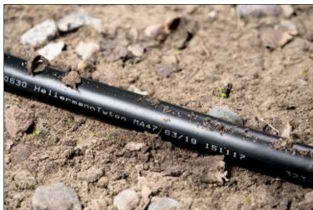
MA47 for above and below ground.