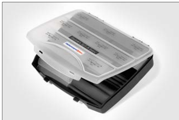
ShrinkKit 321-A Basic.