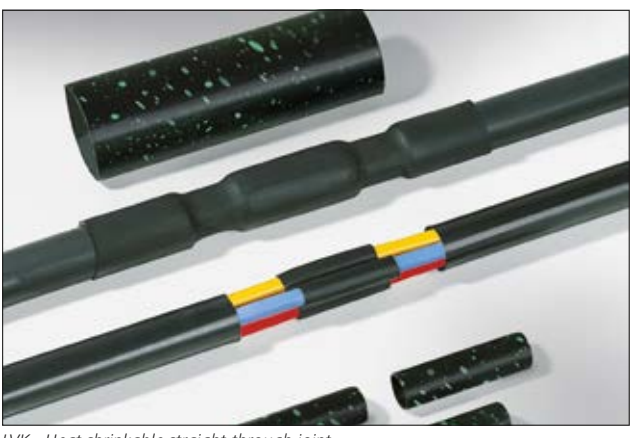
LVK - Heat shrinkable straight-through joint.