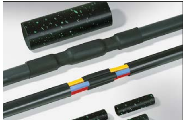
LVK - Heat shrinkable straight-through joint.

Outer sleeve, inner sleeves, cleaning cloth, emery cloth, installation instructions