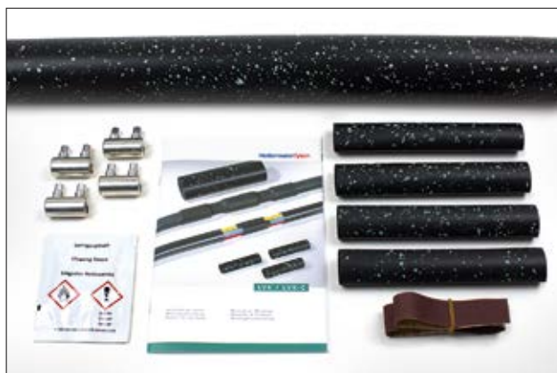
LVK-C: Outer sleeve, inner sleeves, mechanical connectors, cleaning cloth, emery cloth, installation instructions.