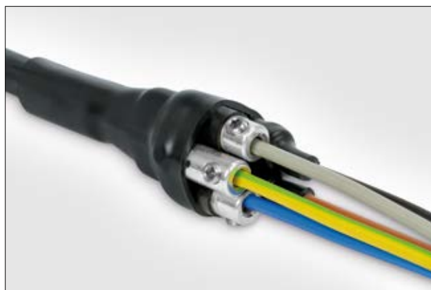
LVK-C - Heat shrinkable straight-through joint with connectors.

Outer sleeve, inner sleeves, mechanical connectors, cleaning cloth, emery cloth, installation instructions