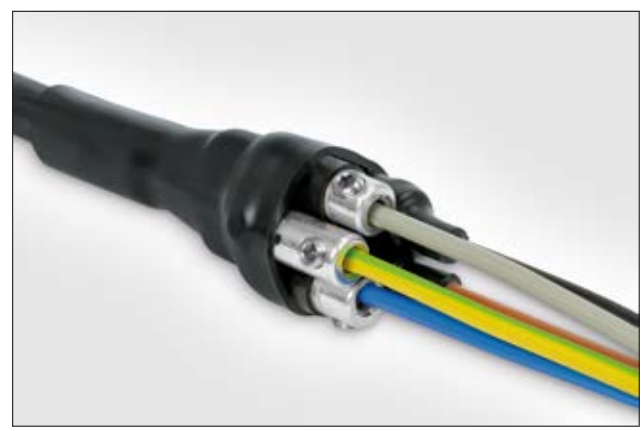
LVK-C - Heat shrinkable straight-through joint with connectors.

Outer sleeve, inner sleeves, mechanical connectors, cleaning cloth, emery cloth, installation instructions