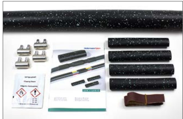
LVK-C: Outer sleeve, inner sleeves, mechanical connectors, cleaning cloth, emery cloth, installation instructions.