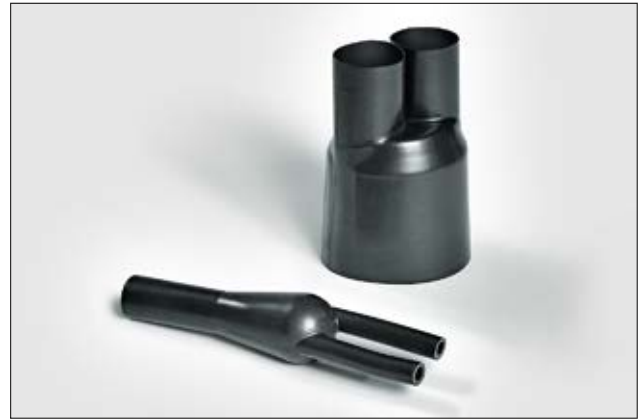
223-2 supplied / fully recovered.