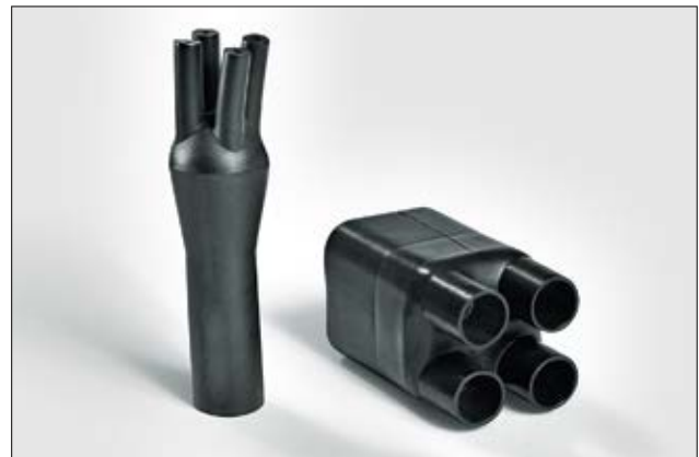
400 series supplied / fully recovered.