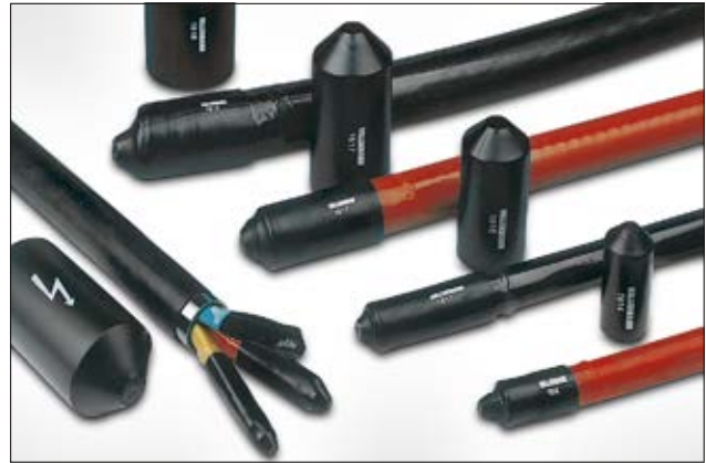
The appropriate end cap for every cable diameter, and cable types.