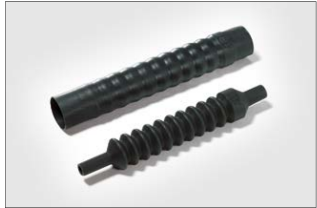
313C722-774 Series supplied / fully recovered.

For Material / Adhesive information please refer to page 260, 261.