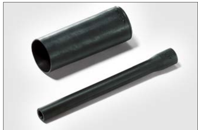
313F322-396 Series supplied / fully recovered.