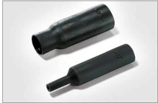
313E445-457 Series supplied / fully recovered.