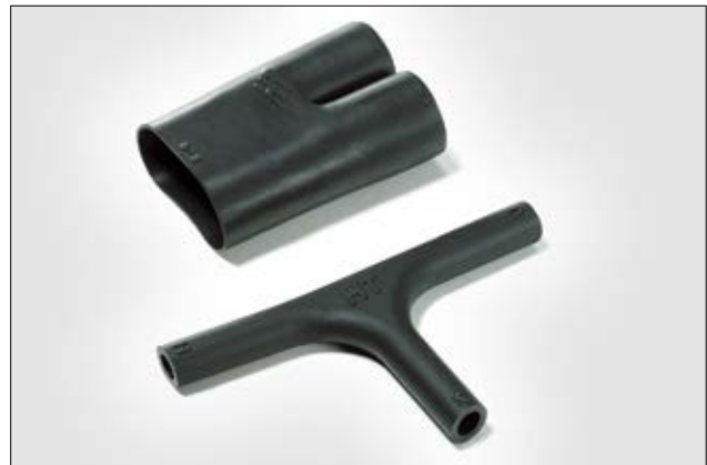
412H622-625 Series supplied / fully recovered.