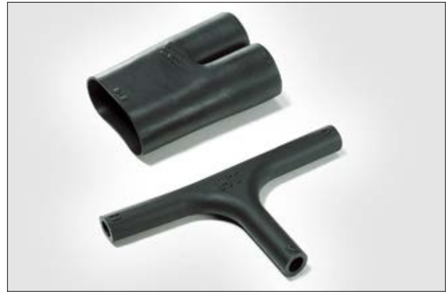
412H622-625 Series supplied / fully recovered.