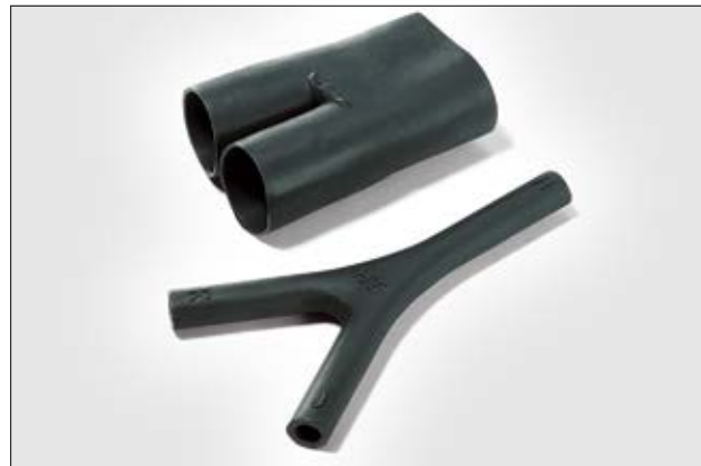
492H412-415 Series supplied / fully recovered.

For Material / Adhesive information please refer to page 260, 261.