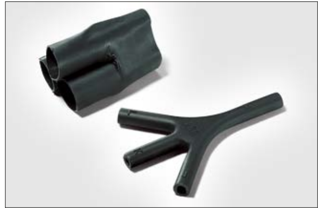
573H532-535 Series supplied / fully recovered.