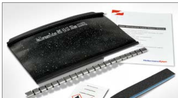
RMS: Repair sleeve, steel closure, abrasive strip, cleaning sachet, instruction sheet.