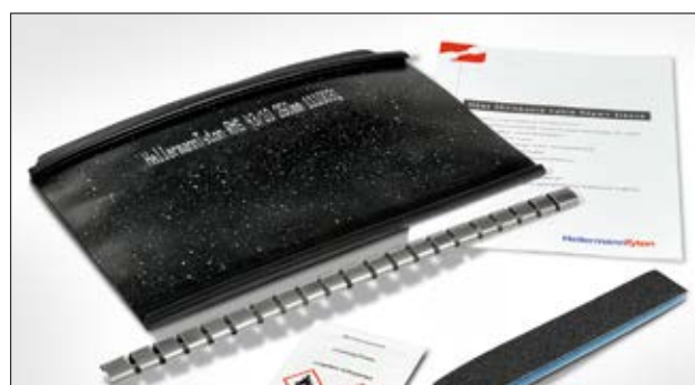
RMS: Repair sleeve, steel closure, abrasive strip, cleaning sachet, instruction sheet.