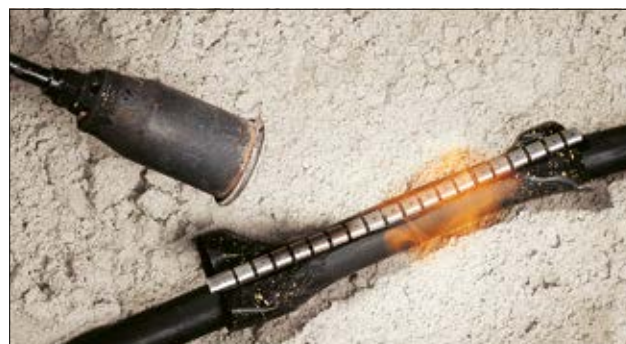
RMS wrap-around sleeves for rapid and secure cable repair.