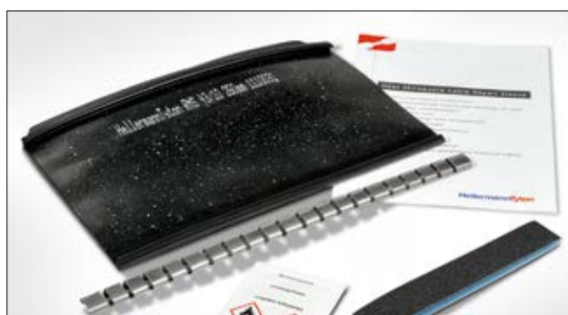
RMS: Repair sleeve, steel closure, abrasive strip, cleaning sachet, instruction sheet.