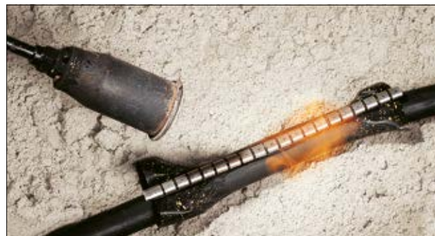
RMS wrap-around sleeves for rapid and secure cable repair.