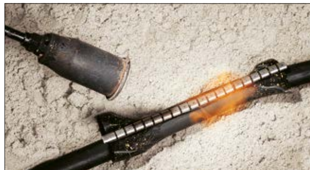
RMS wrap-around sleeves for rapid and secure cable repair.