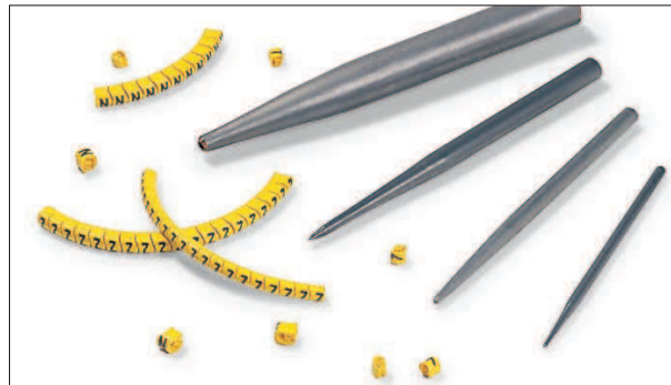
TJC applicator tools.

The refill pack for the cassette contains one basic set without TJC applicator tool.