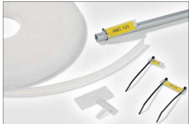
Multi-purpose identification potential: Helafix HC and HCR.