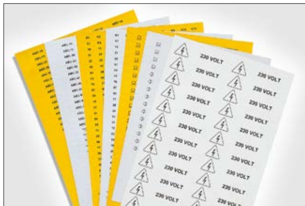
A precise match for Helafix, for permanent identification coding.