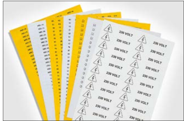
A precise match for Helafix, for permanent identification coding.