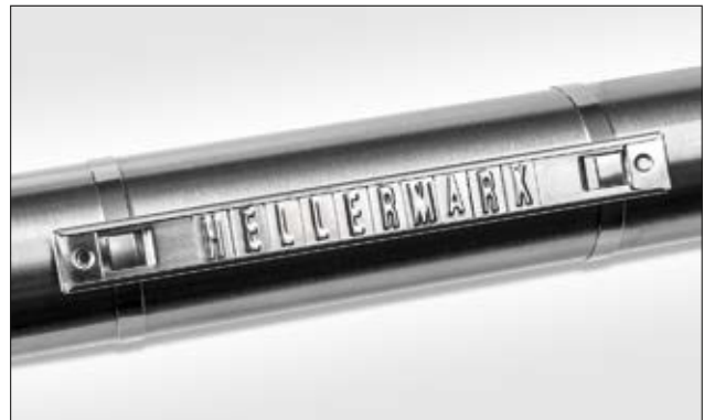
Hellermark SSC and SSM.