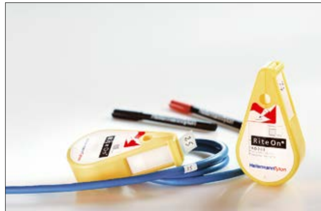
Easy to write and dispense labels with RiteOn label dispenser.