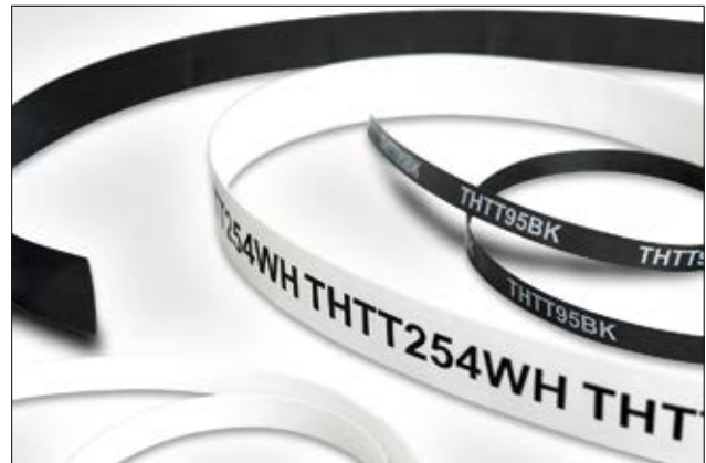
THTT - High temperature tube in black and white.