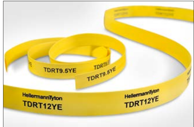
Certified diesel resistant heatshrink markers TDRT.