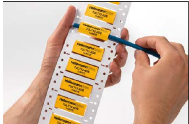
Shrinkable markers TULT DS for military and electronics industry.