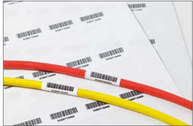
Laminating the mark gives long-term print survivability.