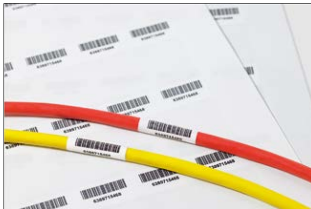
Laminating the mark gives long-term print survivability.