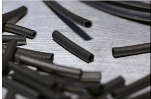
H rubber tubing is highly flexible and easy to apply.